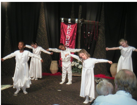
Resurrection Weekend Ministry Mitchell's Bookstore March 2005

Give unto the LORD the glory due unto his name: bring an offering, and come before him: worship the LORD in the beauty of holiness. 1 Chronicles 16:29