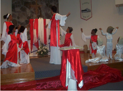
Resurrection Weekend Presentation Living Word Community Church WIM Adult Team March 2005

Give unto the LORD the glory due unto his name: bring an offering, and come before him: worship the LORD in the beauty of holiness. 1 Chronicles 16:29