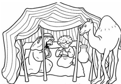
"Blessed is the man who trusts in the Lord." Jeremiah 17:7

Thank you Jesus for the day. Watch me while I work and Play. Preach your word to all my friends Keep me safe till the days' end. Thank you Jesus for the day These are the words that I pray.