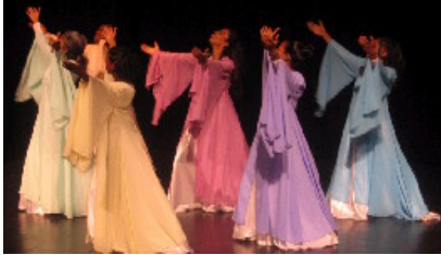
Throne Room Presentation Lester B. Pearson Theatre, Brampton WIM Adult Team 2004

Give unto the LORD the glory due unto his name: bring an offering, and come before him: worship the LORD in the beauty of holiness.