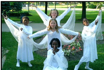
Inspirational Music in the Park Event Gage Park, Brampton WIM Junior Team 2003