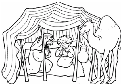
"Blessed is the man who trusts in the Lord." Jeremiah 17:7

Thank you Jesus for the day. Watch me while I work and Play. Preach your word to all my friends Keep me safe till the days' end. Thank you Jesus for the day These are the words that I pray.