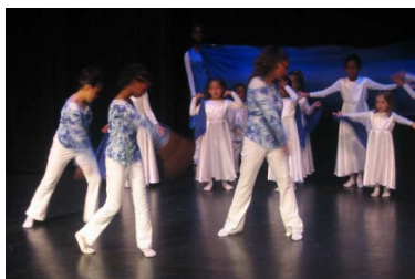
Breathe Celebration 2004