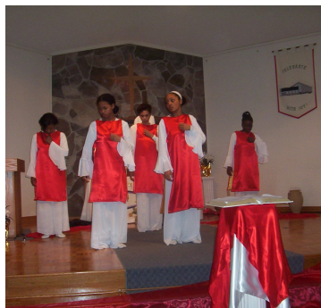
The Lamb Holy Week 2005